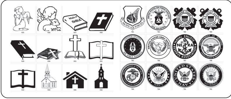
Just a few examples of the art available to accompany your personal message.